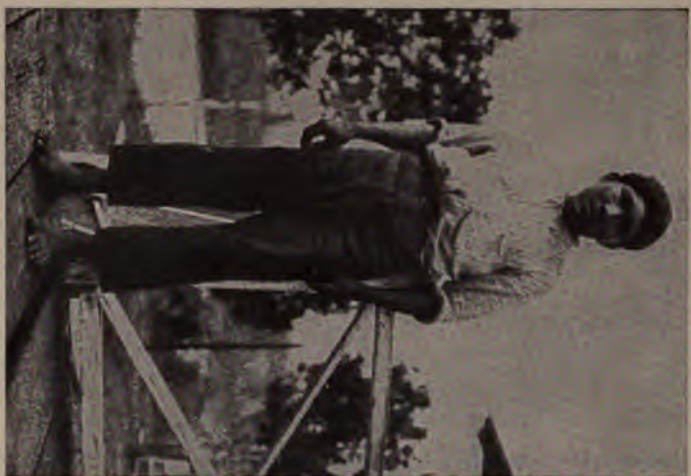
A San Blas Indian Boy